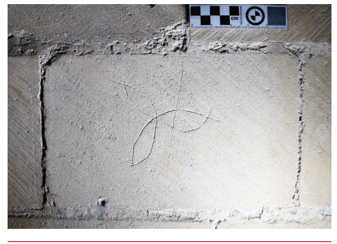
Scale photograph of one of 4,000 visible marks recorded in the recent survey.

One unexpected discovery resulting from the high-level masons' marks survey was the identification of a significant quantity of a surviving painted decorative scheme in the east end of the building. Sufficient fragments remain on the south wall of the South Quire Transept, for example, so that it has been possible to produce a preliminary reconstruction of the entire scheme on this wall. Reconstructions of other portions of the building will follow.