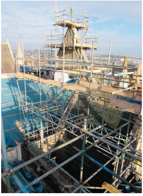
Above: Scaffolding on the North-east Transept gable. Left: One of the masons working on the replacement masonry to the gable.

Top left: South-east Transept roof and the Indulgence Chamber roof under repair.