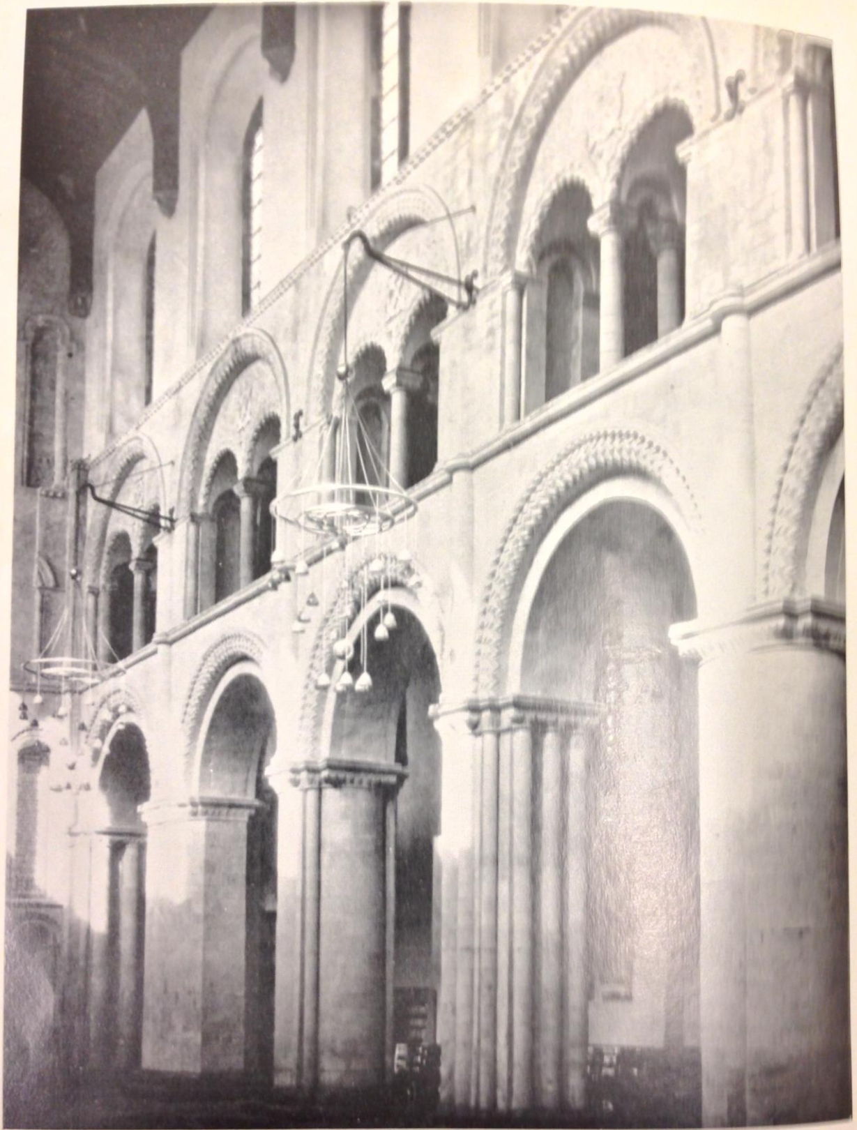
THE NAVE 1965