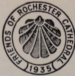
Badge of the Friends of Rochester Cathedral