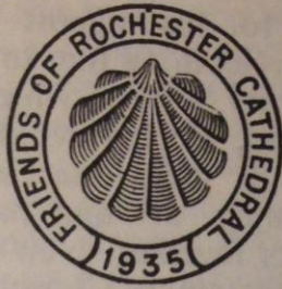
Badge of the Friends of Rochester Cathedral