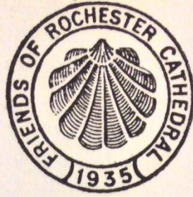
Badge of the Friends of Rochester Cathedral